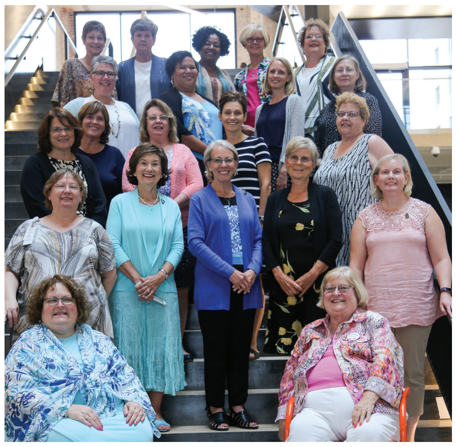
Educators Course participants from the July 30th–August 1st training.

Westberg Institute Highlights over the last few months include a milestone for "the platform" and educational opportunities.